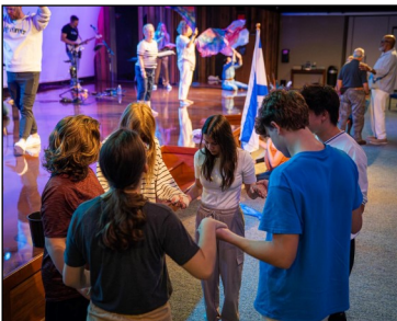
Fellowship of Believers Church

group of intercessors! We are seeing a powerful manifestation of the Presence of God in Sunday services and in once a month 24 hour prayer. One of our "sweet" things is having been asked by some younger folks to be involved in their lives; some even come weekly to our house individually for fel-