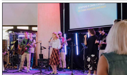
Recent baptism and praise and worship team.

Nations Church is a large family that currently consists of 150 members and a weekly attendance of about 250 people on Sunday service. Our church right now has over 11 home groups and 10 ministries. Our ministries are: order ministry, worship team, media team, cafe team, translation team, holiday organization team, children's ministry team, building committee team, youth ministry team. Each team strives to perform its ministry in the best possible way for God's Kingdom.